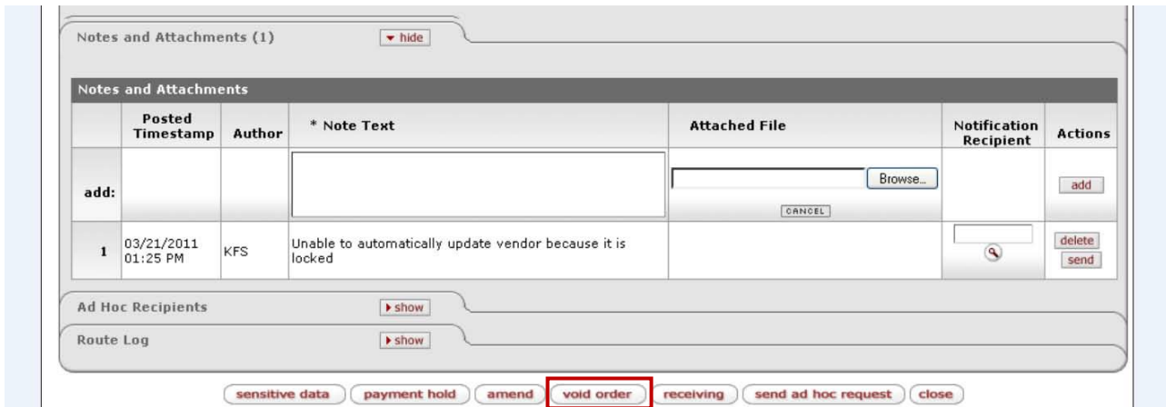
Figure 13 – Action: void order

On a POA, selecting the inactivate button, removes the item from the order. (See Figure 12.)