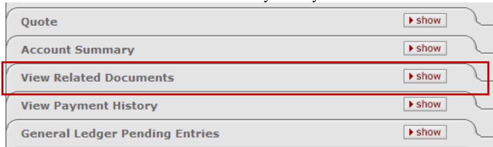
Figure 10 – Example: View Related Documents tab, closed

The View Related Documents tab allows you easy access to all documents related to the POA: