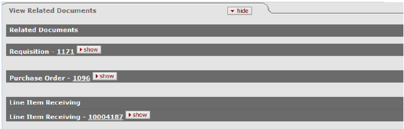
Figure 11 – Example: View Related Documents tab, open

Best Practice recommendation: use the correct e-doc for the task at hand. In the case of the POA e-doc, determine whether a POA is necessary or, if it would be more appropriate to submit a new PO.